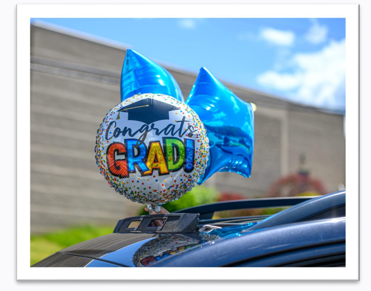
This says it all!